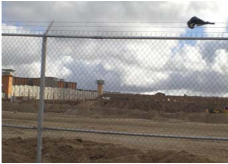
Heading in to Tecate Longo Men's Prison near Tecate Mexico

Its coming up on that time of year again. Temperatures are starting to drop. But when you think of Mexico you don't tend to think of it being very cold. That is not true when it comes to the region around Tecate. It gets very cold there.