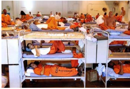
The CDCR uses all available space and turns in into living quarters. They are literally packed in like sardines!

Four prison systems accounted for more than half (52%) of the nations prison population growth. The leading system was the federal Bureau of Prisons, followed by California, Texas and Florida.