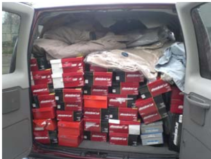
Here is a picture of the van full of Tennis Shoes and jackets for our trip the last time

Its coming up on that time of year again. Temperatures are starting to drop. But when you think of Mexico you don't tend to think of it being very cold. That is not true when it comes to the region around Tecate. It gets very cold there.