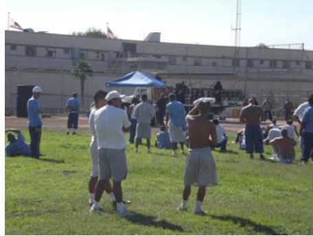
Brothers N Blues doing what they do so well