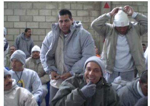
It's a nice feeling to get warm after being so cold

We haven't gotten the actual date of the trip set yet but we are hoping for the first part of February. We'll go down on a Friday afternoon and spend the night in Tijuana then leave early in the morning to get to the prison for the all day event and be back home by late Saturday evening. If any of you are interested in coming with us to Mexico, you must have a passport and we will need to know by the first part of January to be able to have you on the clearance list. Of course we need donations for everything we hope to bring so if you are interested in being a part of this in one way or the other contact the ministry and let us know.